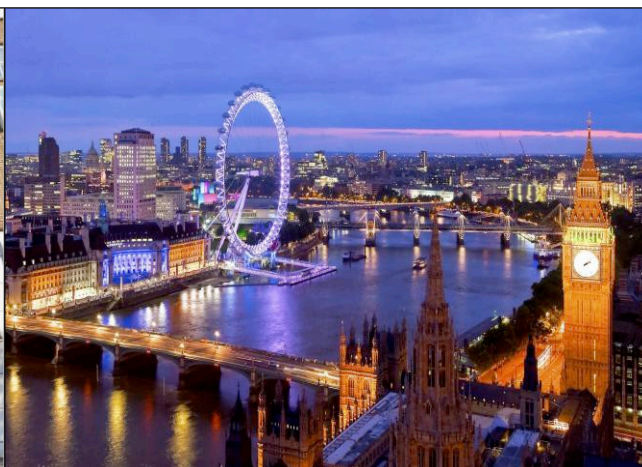
Docklands Academy, London

The AEHT Youth Parliament will be organized as follows: