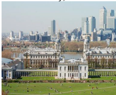
Greenwich maritime museum